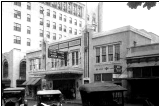
The last movie theater downtown: The Beacham Theater (now Taboo nightclub)