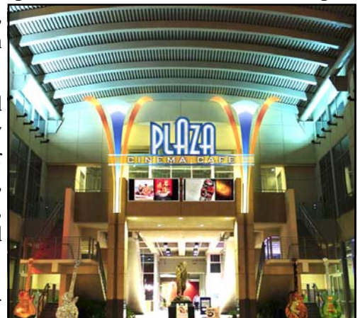
Plaza Cinema Café at Orange & Church

The long-stalled project, which was a key part of the city's re-development plans for downtown, got a boost last December when they approved a $6 million incentive to the RP Realty, the new building developers. The city proposes to raise the funds for the incentive by levying two special assessments: a retail assessment totaling $2.5 million, to be paid to the city over 15 years and a parking assessment of a total of $3.5 million paid to the city over 10 years.